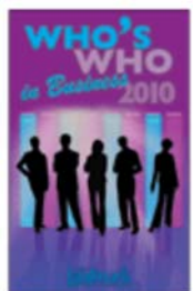
Who's Who in Business 2010