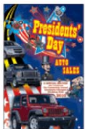
Presidents' Day Auto Sales